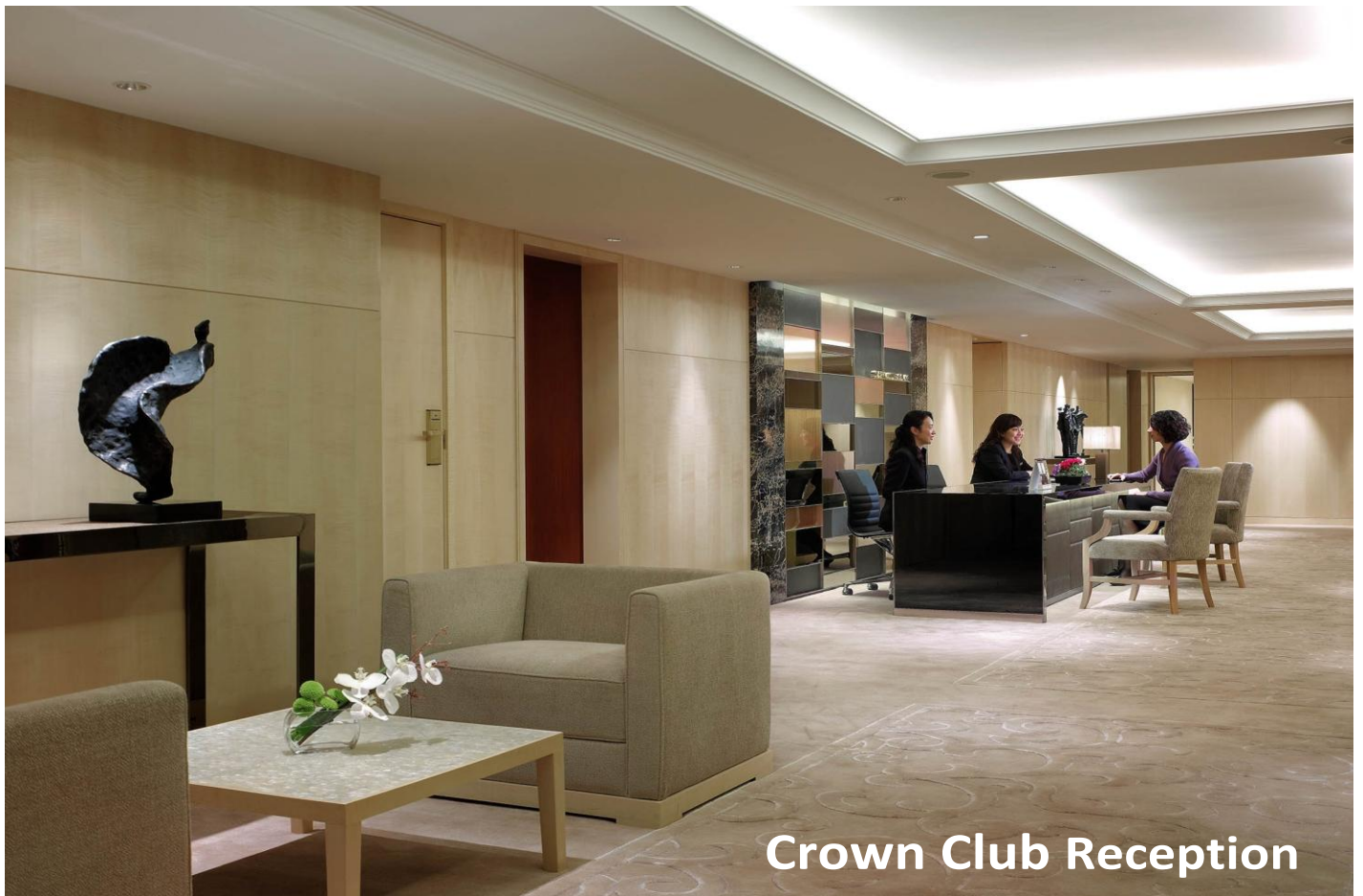
Crown Club Reception