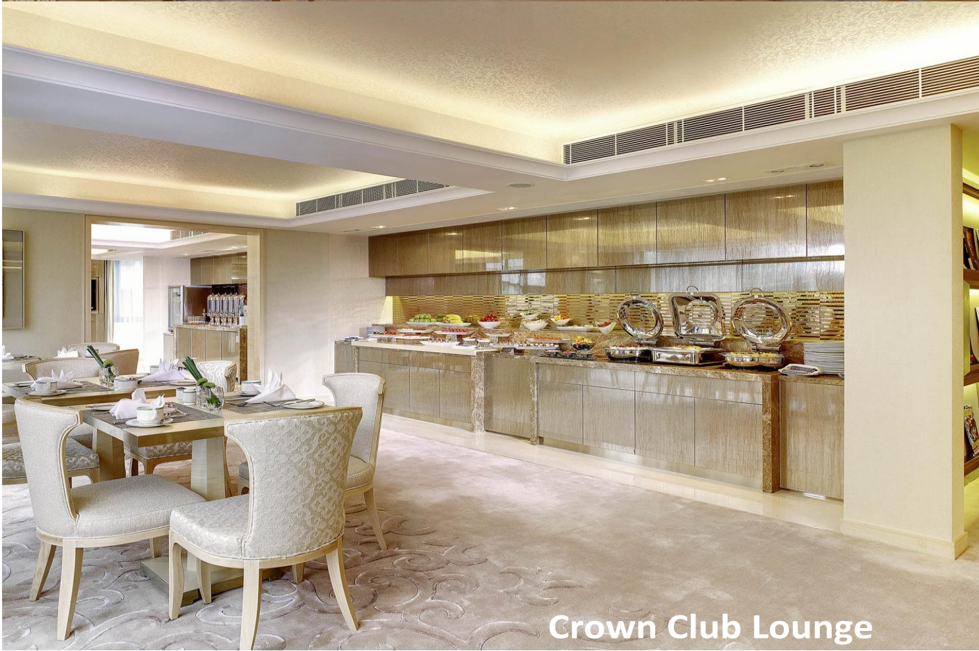
Crown Club Lounge