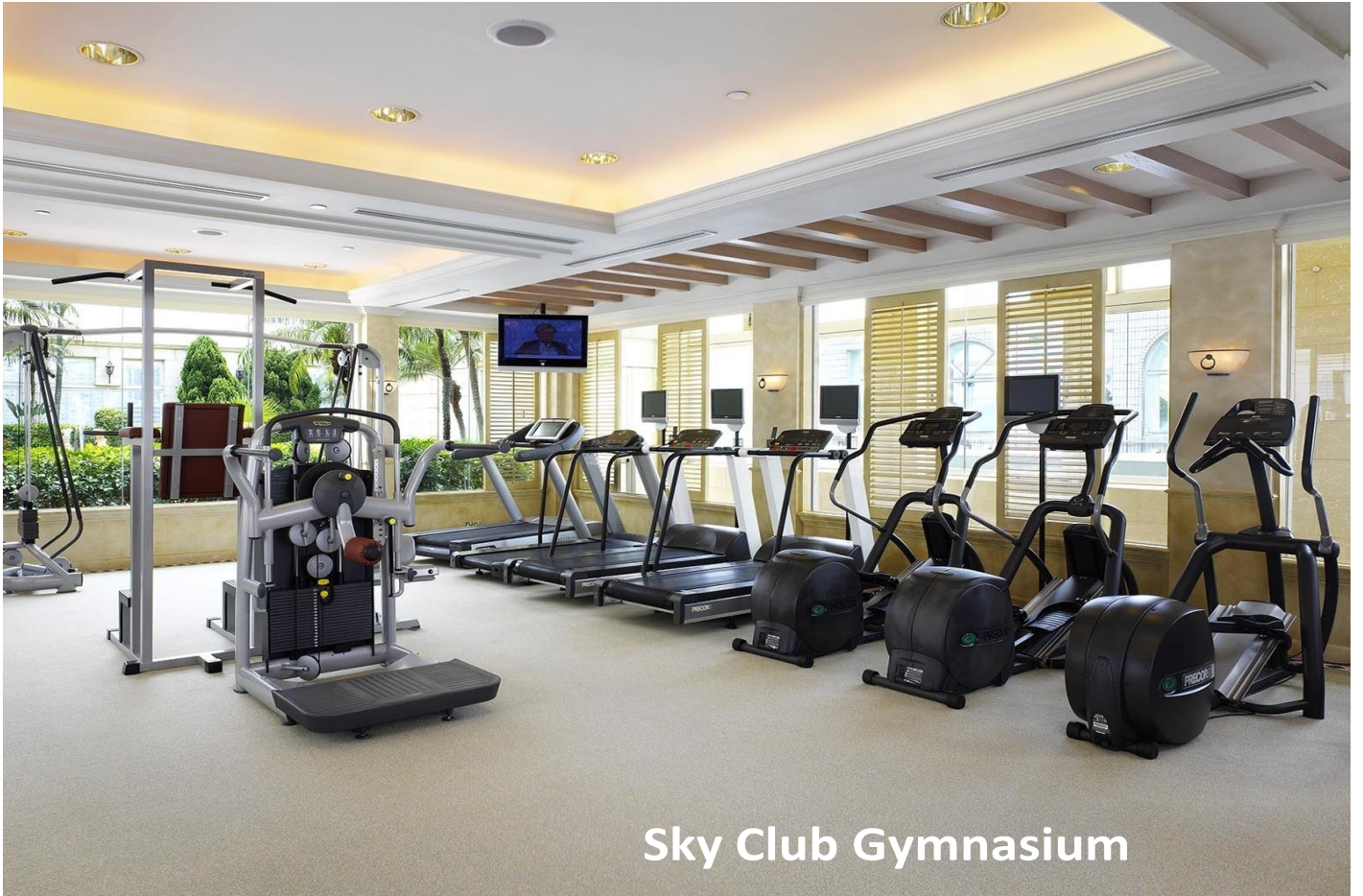
Sky Club Gymnasium