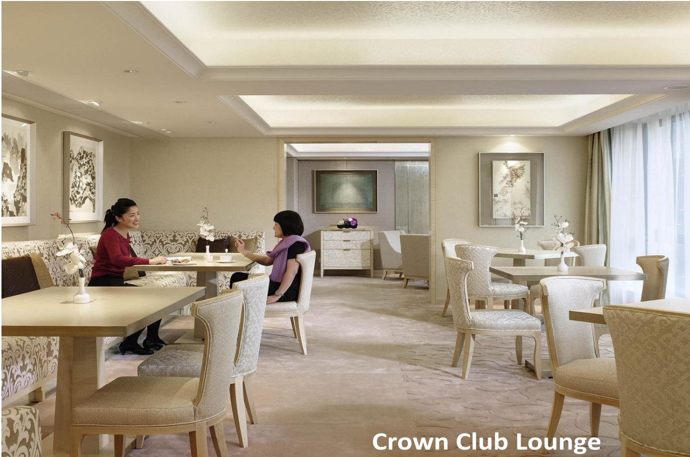
Crown Club Lounge