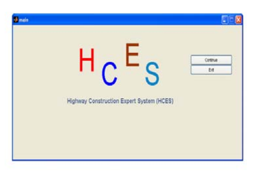
Figure 2: First Window in HCES

The Highway Construction Expert System rapid prototyping HCES was developed for giving advices on how to minimise the effect of solid waste that are generated in the construction site to the ambient environment, this can be accomplished by identifying the impact associated with this activity to the adjacent water bodies and identifying the parameters involved for each type of solid waste generated during highway construction. (Total suspended solids, turbidity, oil and grease, heavy metals and so forth). Figure 2 shows the first window of the HCES. To start formal consultation the user needs to press on the Continue button (Figure 2) that will open new window as shown in figure 3. This window (Figure 3) comprises the main window of HCES. The system will be divided into two parts, one of them is for the highway construction activities that do not need to choose any site characteristics (i.e. topography, drainage, soil type, ground cover, critical areas and so on) and the other part is for the highway construction activities that have to use site characteristics so as to give recommendations based on these site characteristics. For our rapid prototyping it will be under the first part that does not need any site characteristic and the recommendation will be given basing on the contamination level only (i.e. water quality parameters). For the other part of the expert system, it will be developed later on.