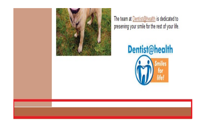
Figure 4. Display showing the footer of the web page should be reworked to cater for the xml sitemap.

There are no XML site maps available on this website, and one should need to implement this in their footer. As seen in the image in figure 4 below, the footer of the web page should be reworked to cater for the XML sitemap. And the XLM sitemap needs to be submitted to google so that the URLs inside can be indexed.