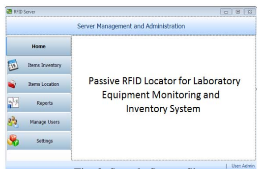
Fig. 2. Sample Screen Shot

Proceedings of the International MultiConference of Engineers and Computer Scientists 2013 Vol I, IMECS 2013, March 13 - 15, 2013, Hong Kong