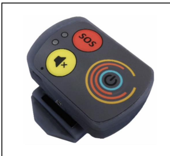
Fig. 1. Device used

On the communication side, it should be noted that the device does not communicate with the anchors (beacons) but listens to them only for geo-localizing (principle virtually analogous to that of the lighthouse in navigation), so, in technical jargon, "sniffing" the Bluetooth signal emitted by the anchors, the device is able to define its precise position and to communicate it in the event of an alarm. The device also communicates with the server to launch the alarms.