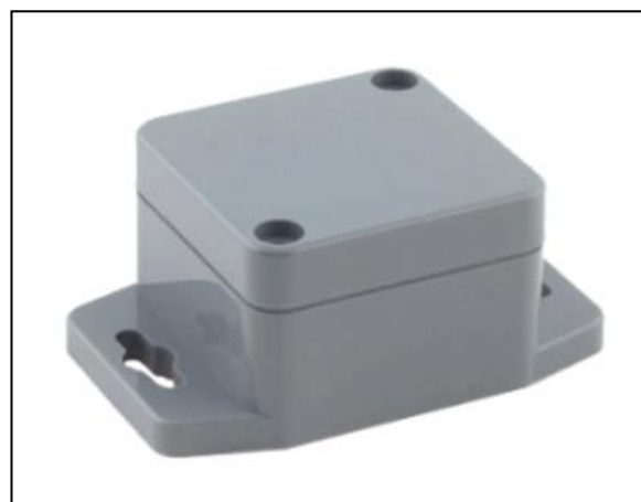
Fig. 2. Anchor

The reference anchors (beacons) are installed in a variable number (usually 2-4) on each machine or within the isolated or confined areas to be monitored so that each device worn by the operators present therein can continuously refer to one of the anchors installed. The anchor is shown in figure 2.