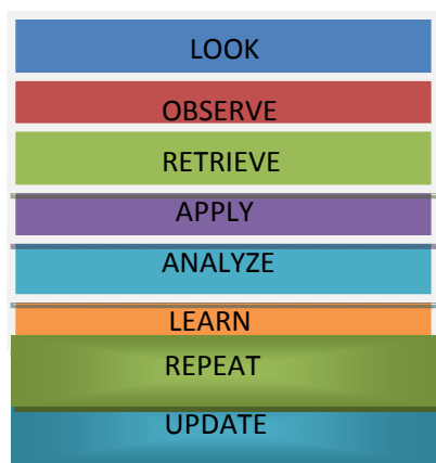
Fig 1: steps involved in proposed ethical way

This agent would go in for various stages in performing any task towards success in a ethical way. Hence the following are the ways through which this performing thing would be done.