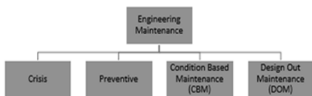
Figure 1: Four basic types of engineering maintenance (Mushiri, 2012).

Maintenance is the fundamental of all machinery for ongoing production without some failures and stoppages hence Just In Time (JIT) systems application. Though nomenclature changes from industry to industry and in many countries, generally there are four basic types of maintenance which are as shown in figure 1 by Mushiri, 2012 (the researcher for this paper).