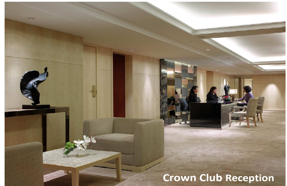
Crown Club Reception