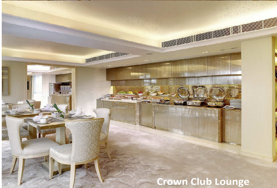
Crown Club Lounge