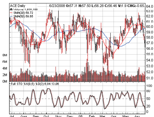
Figure 2: Bollinger band crossover BSRCTB (Combinatorial Algorithm)

The following figure explains the Bollinger band crossover of the sample data