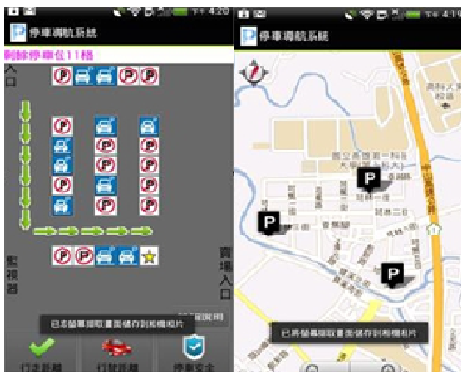
Fig. 3. Operation interface of indoor PGIS application

This system can record the current parking location. Therefore, we can save the time for finding parking spaces. Moreover, another feature is the combination of stores to provide consumers with information so that users can know store promotional activities in their car. In a word, this indoor PGIS application can help users to improve the convenience and efficiency of parking. Fig. 3. is the humanized operation interface of the indoor PGIS application.