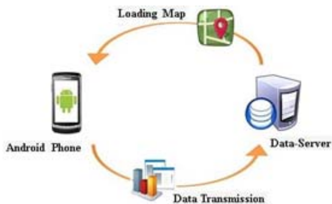
Fig. 2. Framework of indoor PGIS application

using a wireless network to connect to the database; the database provides immediate parking plan and business information for users to use; mobile phone feedback information to the database.