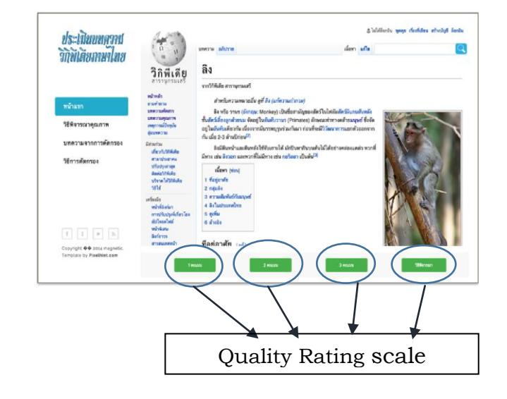
Fig. 6 The user rating scale