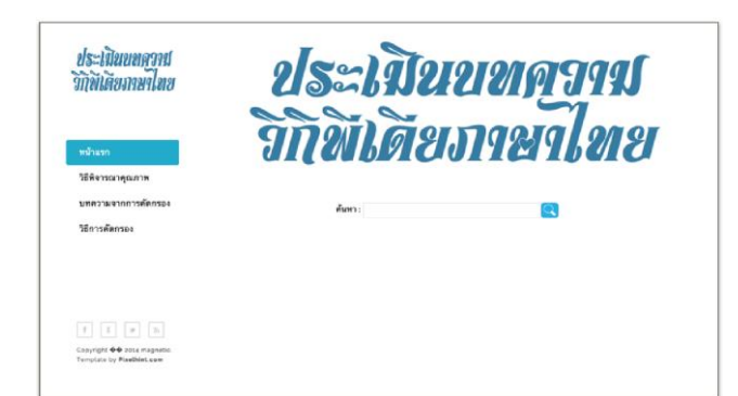
Fig. 5 Main page of the filtering system

We have implemented the web application that facilitate user with 2 functions. 1) The keyword search function and 2) the user rating (Fig5, 6). After the search article is retrieved the quality of that article which obtained from the algorithm is shown. User can feedback the system with the quality rating so that the system can update the quality in term of statistics and can be used later in the learning process of the filtering framework.