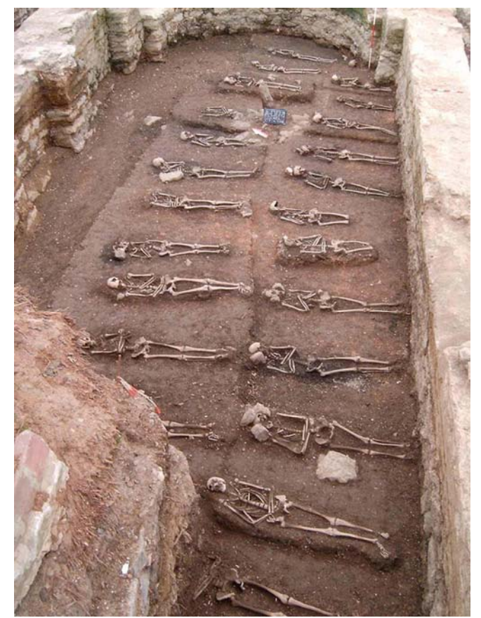
Figure 11: Skeletons in the Religious Building in Uskudar

The discovery of the Temenos wall outside the squareplanned structure makes it all the more interesting. This religious building must have been a church or a chapel or a