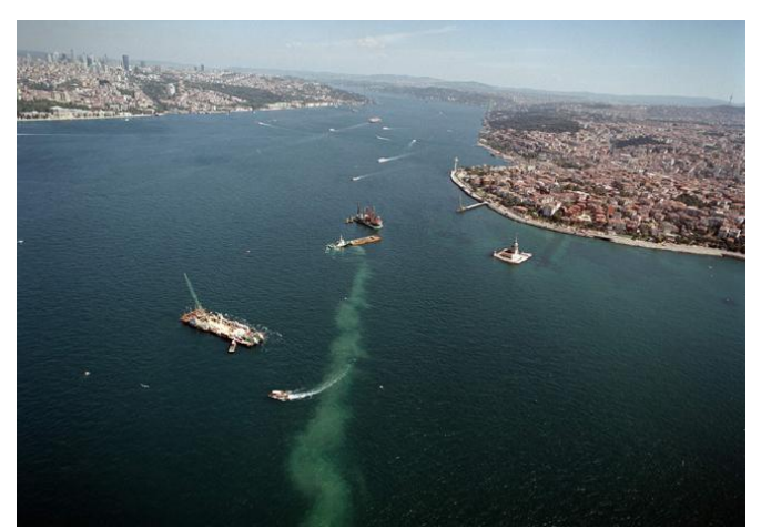
Figure 8: Turbidity plume due to dredging in the Istanbul Strait

Another important issue that was considered during the dredging was the fish migration through the Istanbul Strait. The length and start of the two fish migration periods per year varies for each type of fish. However, it is generally accepted that the spring migration lasts from 15 March to 15 June, and the autumn migration from 5 September to 15 November. The flow in the Istanbul Strait is a strong, stratified two-layer system. The spring migration takes place from the Marmara Sea towards the Black Sea, in the lower saline layers that flow in the northern direction. The autumn migration takes place in the opposite direction in the upper non-saline layers that flow towards the south, or in the neutral zone between the upper and lower current. Turbidity of the water during the fish migration period was the potential main problem. Fortunately, the currents in the Istanbul Strait are quite constant and always present. Therefore, the spill from the dredging concentrated in welldefined and narrow areas and the fine debris was carried to the natural sedimentation areas in the Marmara Sea and in the Black Sea (Fig. 8).