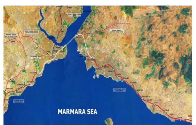
Figure 1: Alignment of the Marmaray Project

The Marmaray Project provides a full upgrading of the existing commuter rail system in Istanbul, connecting Halkalı on the European side with Gebze on the Asian side with an uninterrupted, modern, high capacity commuter rail system.