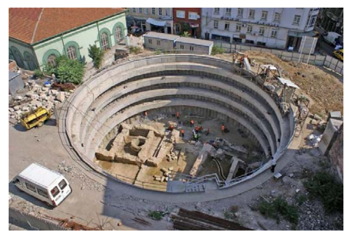
Figure 9: Sirkeci West Shaft Archaeological Excavations

Istanbul was the capital of three Empires, the Otoman, Byzantine and East Roman Empire. In Sirkeci, during the construction of a 25 m diameter shaft, a 13 m cultural fill layer was excavated by archaeologists (Figure 9). In the upper layers architectural findings from the Ottoman period were encountered. The subsequent layer contained structures and small artefacts from the Byzantine period. Then Roman architecture and artefacts were unearthed. The last 3 m took 6 months for the archaeologists to excavate, understand and remove. This layer belonged to the colonial period of Istanbul.