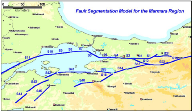
Figure 5: Fault Segmentation Model for the Marmara Region

A number of M>7.0 earthquakes have occurred in the Marmara Region since 1500 (Fig. 4). After detailed assessment of the distribution of reported eartquake damages, these major historical earthquakes were correlated to the fault segmentation model presented in Fig. 5. A Mw=7.5 (moment magnitude) earthquake was selected as the maximum credible earthquake scenario for this Project and assumed to take place on Segments S5 through to S8 along the main North Anatolian Fault Zone.