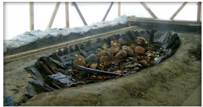
Figure 10: Shipreck from 11th century A.C. in Yenikapi

27 ships were uncovered so far during the excavations (Fig. 10). Amongst these are commercial ships of varying sizes, small fishing boats and boats with long oars. After the measurement surveys and documentation work is done, the ships are transferred by experts to special pools where for a period of 5 years they undergo conservation work. Following this treatment they are ready to be exhibited.