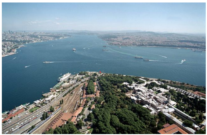
Figure 12: Sea traffic in the construction area

shared transfer stations. To minimize possible time delays due to interfaces between these parties forms a focus point for the Employer.