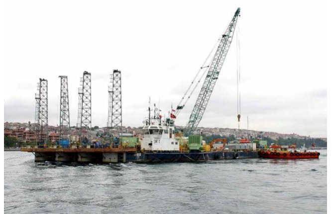
Figure 6: Compaction Grouting Works in the Istanbul Strait

- repair work could be performed with minimum disruption to the operation of the facility.