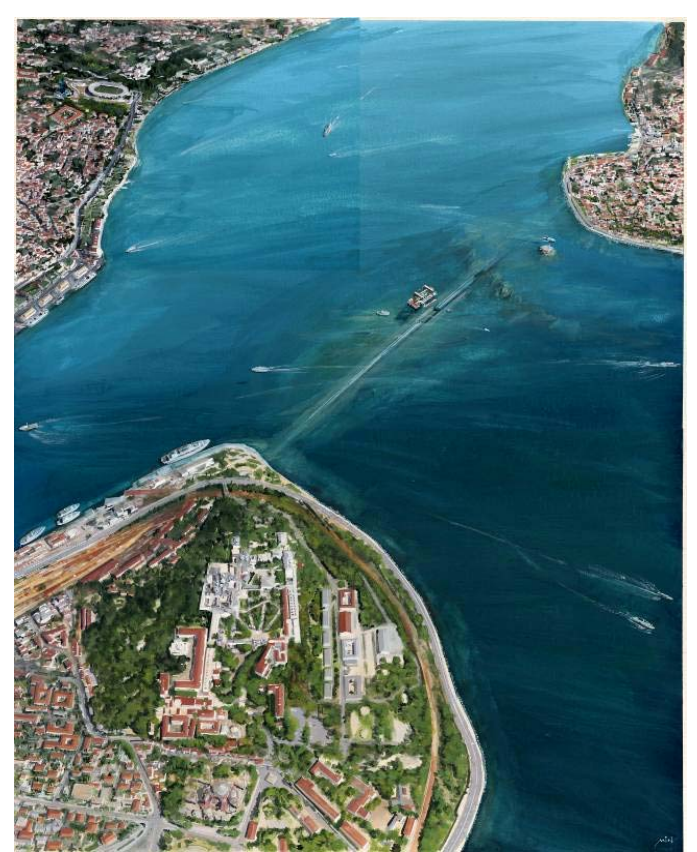
Figure 2: Marmaray Project, Istanbul Strait Crossing

When introducing major infrastructure Projects such as the Marmaray Project, it is important to realise that it will influence not only the daily traffic pattern of Istanbul, but will also influence the development of the city and the region.