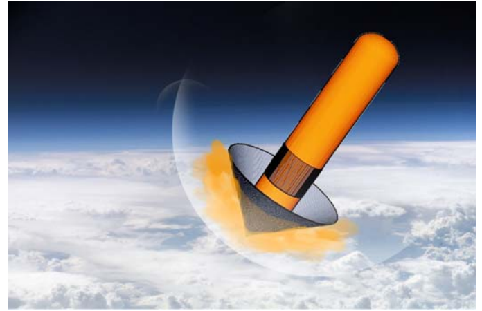
Figure 2: ET with the extended HTHS during re-entry

Soon after the separation, we may orient the ET, in a similar fashion to the space shuttle re-entry. This can be achieved by proper guidance using the technology based on the OMS (Orbital Maneuvering System). As we are having a near vertical fall with nose pointing down, we can have a conical retractable heat shield as shown in Fig. 2.