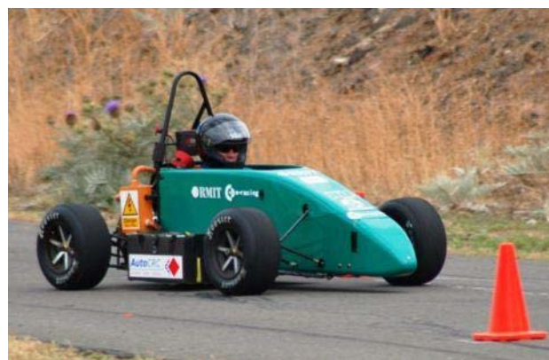
Figure 2 RMIT 2008 First Electric FSAE Car

Whilst there are slight variations between countries, the rules are based on the USA competition outlined below: