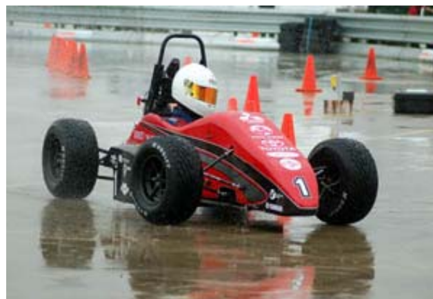
Figure 1 RMIT 2007 IC-Powered Car

stroke engine and limited the power via an intake restrictor – a regulation that remains to the present day. Events are now running around the world including in the UK, Brazil, Italy, Germany, Australia and Japan, with more events planned.