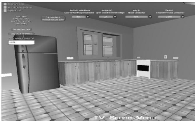
Fig. 2, View of kitchen and GUI in 'VES' (from colour original)

As the user navigates through the virtual home, electrical safety guidance associated with the user location can be obtained via the GUI. The unique information provided for the user in each location is broken into three sections. The first presents a database of accident scenarios associated with that location based on information obtained from [2]. The ability to select from a range of electrical accidents in the database enables the user to see how accidents occur and the measures required to prevent such accidents. The second section provides general safety advice related to the users' location and the third section provides safety guidance and maintenance advice for the electrical appliances installed in that location