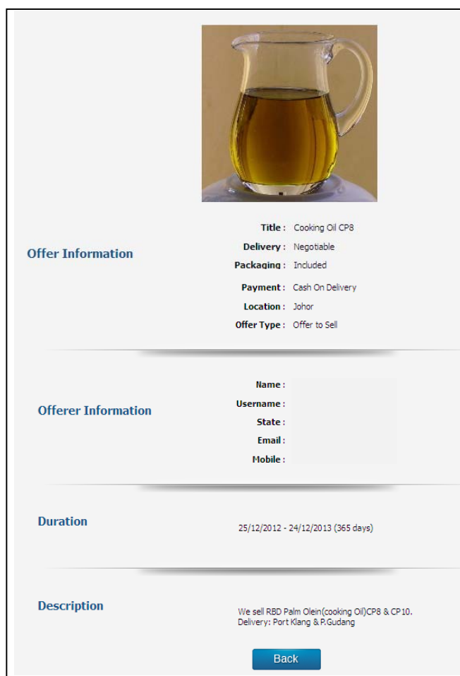
Appendix 1: An example of a full online product description on Agribazaar portal