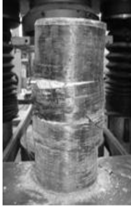
Fig. 2 Failure of CFRP confined specimens

For short specimens, the fiber rupture starts mainly in their central zone and then propagates towards other sections. Regarding slender specimens, the collapse was mostly concentrated in their end regions, indicating that the greater the slender ratio, the smaller the area of CFRP ruptured.