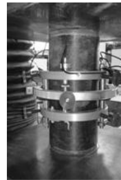
Fig. 1 Test setup

Specimens were loaded under a monotonic uni-axial compression load up to failure. The load was applied at a rate corresponding to 0.24 MPa/s and was recorded with an automatic data acquisition system. Axial and lateral strains were measured using extensometers. The test setup for the various specimens is shown in Fig. 1.