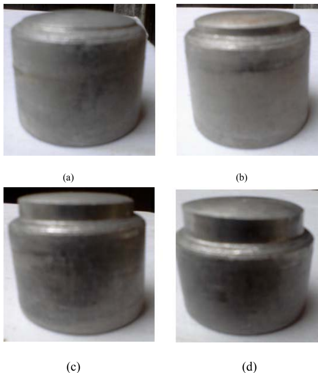
Fig. 2 Extrudates formed with different punch diameters (a) 12 mm punch diameter; (b) 14 mm punch diameter; (c) 16 mm punch diameter; (d) 18 mm punch diameter

Fig. 3 shows the graphical representation of the load (kN) applied against the travel of ram or the ram displacement (mm) for the punch diameters of 12 mm, 14 mm, 16 mm and 18 mm respectively.