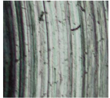
Fig. 3: Co-Cr-W alloy sample wear track