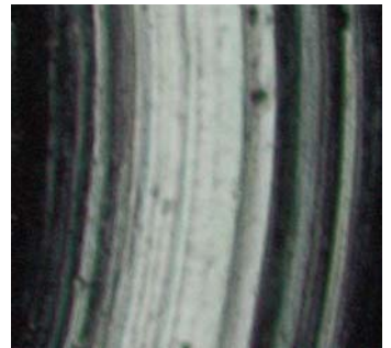
Fig. 2: Wear track of Co-Cr-Mo alloy samples