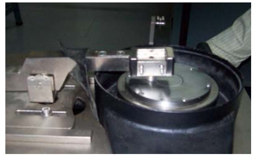
Fig. 1: Wear resistance test on Pin on Disc Tribometer

Evidently all the Co-Cr-W samples have exhibited high hardness values than the Co-Cr-Mo alloy samples. The content of tungsten in Co-Cr-W alloy could be the reason for exhibiting the high hardness. The large variation in the hardness values of the samples indicate that the process parameters have high influence on the samples deposited.