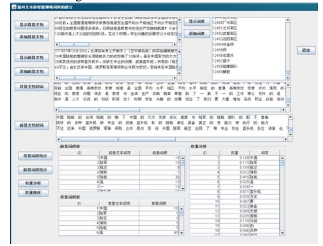
(a) Document segmentation, Statistic word frequency and weight calculation

Based on the planed functions of the domain lexicon and the techniques of text mining, we build the domain lexicon under the Windows environment. The OO ideas and NetBeans visualization approaches are combined with our system. Based on the classed document collections from Chinese Department of Fudan University, we select a document collections of A domain as the background document collections, select another document collections of B(different from A) domain as the foreground document collections. The domain lexicon is built by extracting the domain topic words of the foreground document. Let's take the building of military domain lexicon as an example to analysis and explain. The whole program running figure is shown as in Fig.3.