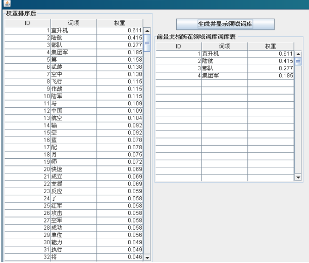
(b) sorting and building weight domain lexicon Fig.3 domain lexicon generation In Fig.3, we select 100 pieces of educational documents as

the background document, extract domain topic words from a military document named "中国陆军航空兵", gain 4 military words, namely "直升机", "陆航", "部队" and "集团军". This reflects the document topic in some degree. Because the "陆军航空兵" usually appears as the name "陆航", so "陆航" is extracted. Thus, we can add "陆航" to the domain lexicon artificially. In the follow study, we may further improve the domain lexicon by setting thesaurus table.