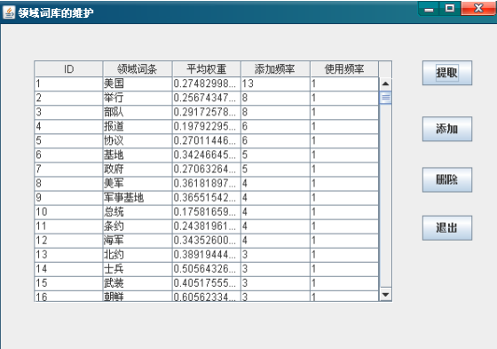
Fig.4 trained military lexicon

Through training 76 pieces of military documents from Chinese Department of Fudan University, we gain 321 pieces of lemmas, in which 211 pieces is no repeated, and 13-16 pieces are of no obvious representation significance. The lemma accuracy rate of the military domain lexicon reaches 92.41% to 93.83%. The trained military domain lexicon is shown as in Fig.4.