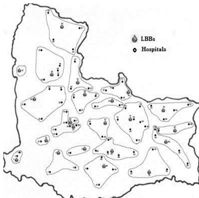
Fig. 3. The optimal solution for the CLPER model, when m=50 kilometer.

Fig. 2 shows the cost components of the CLPER model