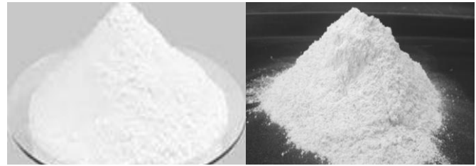
Fig. 2. Pictures showing the fine state of glass activated plastic (GAP) industrial waste powder

The mix proportion used for this study was 1:3 and the OP-L/GAP substitution was computed by weight with W/C ratio of 0.45. The proportions of OP-L/GAP waste powder in the plaster were 100:0% (as control), 90:10%, 85:15% and 80:20% respectively. The use of GAP waste powder as partial aggregate replacement did not reveal any segregation challenges and the outcomes of the resultant mixtures had closely similar characteristics to traditional ones. Fig. 2 shows the GAP industrial waste powder. For the 15 and 20% replacement rate, the specimens were found to significantly decrease in workability and as such, a 0.5 and 1% dose of superplasticizer was added by weight to the respective mixtures to achieve a balanced workability. For the respective plaster mixtures investigated in accordance with British Mix Design (DOE) method, 100 mm cubic specimens were produced, cured by full submergence in water for 7 days and air dried for 21 days at room temperature. In accordance to the BS 8110 and UNI EN 1015-11, the compressive and flexural strengths of the plaster specimens were determined by observing the strength loss for every increased dose of the GAP industrial waste powder at various curing periods.