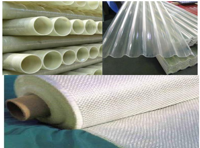
Fig. 1. Pictures showing glass activated plastic (GAP) used in various forms

polyester, broadly utilized in numerous fields from buildings to furniture as shown in Fig. 1.