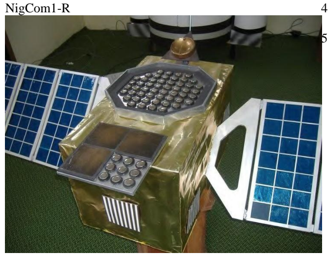
Fig.2 Model of the NigComSat-1 in CSSTE

Note: Due to its early demise, CGWIC replaced it with the