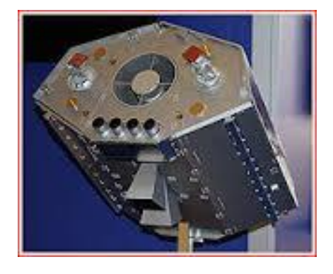
Fig. 4 Image of The NigeriaSAT-2 before launch

The Nigeria sat-2 was also designed bySurrey Satellite Technology on the request of the National Space Research and Development Agency. It was launched on August 17, 2011 by a Dnepr launch rocket from Yasny Lunch site located in the Orenburg region, Russia. It was built at a cost of $35million