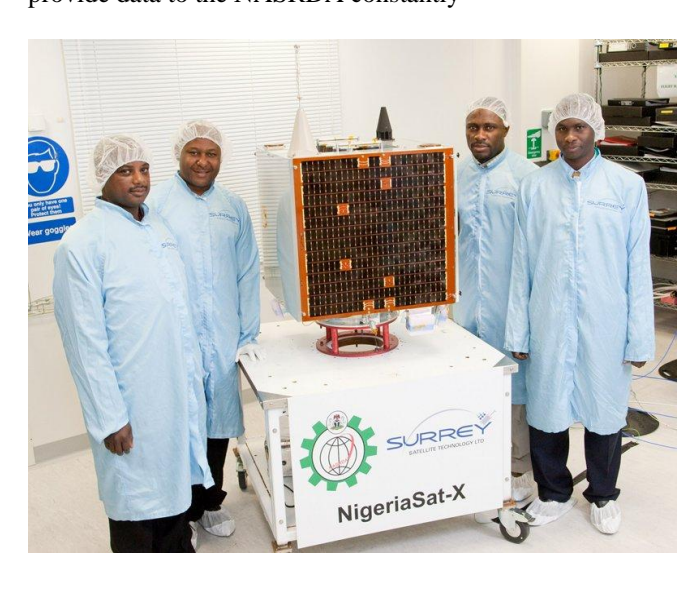
Fig.3 Model of NigeriaSAT-X before launch

promote human resources nationally to use space applications in Nigerian development provide data to the NASRDA constantly