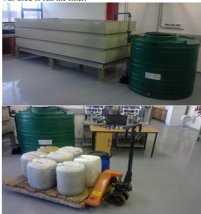
Figure 3: HRF and collected greywater samples for treatment

The study framework involved data collection, principal component analysis, multiple regression analysis and principal component regression. At first instance, greywater collection (three times a week) for a period of three months from the informal settlement of the study area was the primary focus. For each run, 420 litres the collected greywater samples were transported from the community to the Mangosuthu University of Technology, Chemical Engineering research laboratory for experimental work using a constructed pilot scale HRF with 3 m length (Figure 3 below). Quartzite gravel was selected and used as a filter media in the roughing filter. The gravel sizes were: 15 - 13.2 mm in 1st compartment; 13.2 - 9.5 mm in 2nd compartment and 9.5 - 6.7 mm in 3rd compartment. The operating mode of the horizontal roughing filter system was based on the batch feeding mode. After manually filling the feed tank with 420 litres required for the single batch operation, a predetermine filtration rate between 0.3 m/h was used to run the filter.