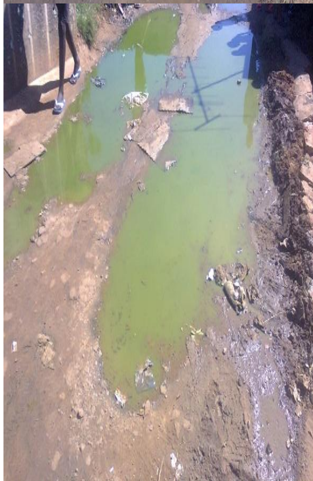
Figure 2: Greywater runoffs in the study area