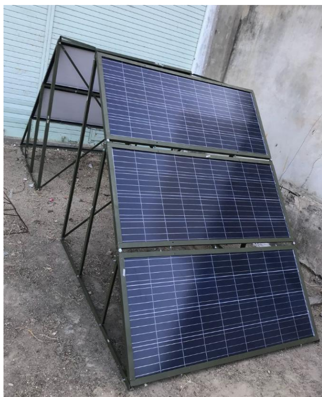
Fig. 2. Trapezoidal support system for polycrystalline photovoltaic solar panels.

The photovoltaic system consists of five (5) 140 Wp photovoltaic panels; one (1) 1kw inverter; three (3) 12V 150 AH batteries; one (1) 0.75 kW variable speed drive; and one (1) control and protection panel. To support the panel system, two structures were built, one trapezoidal on which the panels can rest, which also serves to cover the system; and the other to position the panels at greater height.